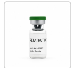
Retatrutide 30 - WL-P00022 Green Cap

This sample contains a single compound which is not retatrutide